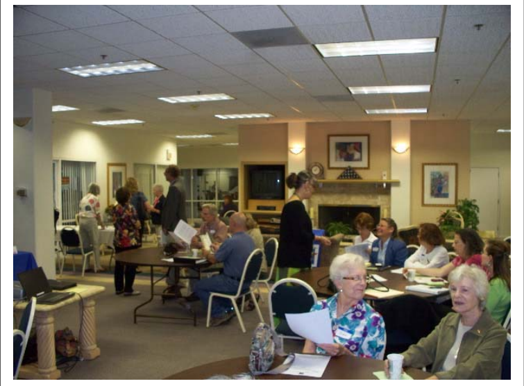
League members and visiting Prescott Area Leadership participants enjoy socializing before the meeting.

If you weren't there, you missed a great meeting!