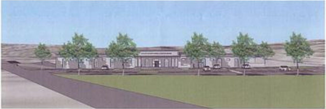
ENTRY PERSPECTIVE VIEW